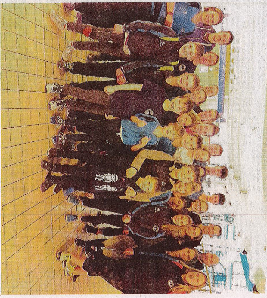
The Wells Swimming Club Cotswold League team from the opening round of the Cotswold League

The all-round team effort ensured that Wells took third on the night and are looking forward to the next round.